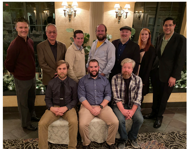
The Valley Creek Productions Team

The Coatesville-based team is made up of skilled creative videographers and licensed aerial drone cinematographers. The company was voted Best of the Mainline by Main Line Today Magazine in 2020, The Knot Best of Weddings in videography for 2018-2020, one of the top three videographers in Philadelphia by Philly Hot List for the past five years, and winner of WeddingWire's Couples Choice Award the past 10 years. "They are excited to work with businesses and non profits in the Coatesville area as new companies move into downtown."